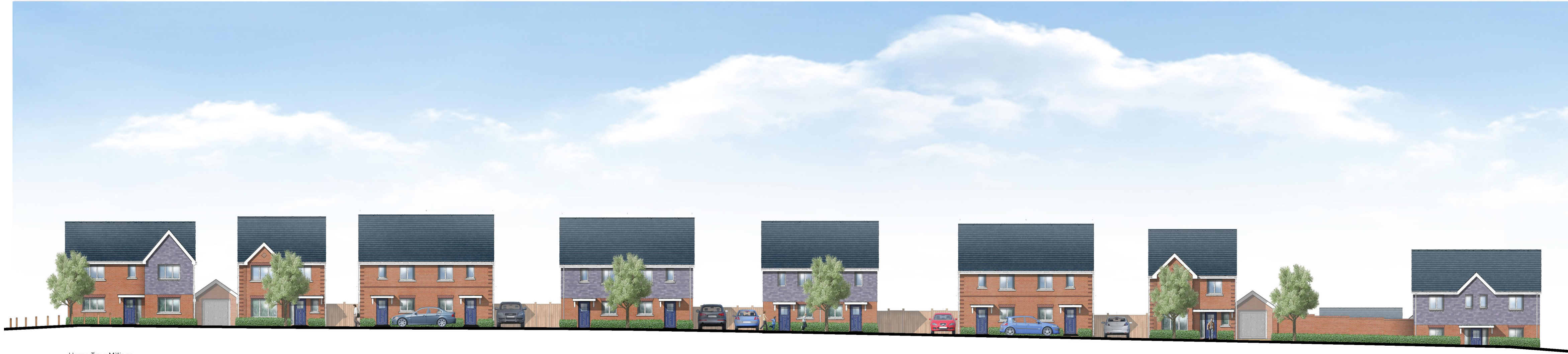
House Type Milliner Plot 80 House Type Scrivener Plot 79 House Type H30 Plot 78 House Type H30 Plot 77 House Type H30 Plot 76 House Type H30 Plot 75 House Type H20 Plot 74 House Type H20 Plot 73 House Type H30 Plot 72 House Type H30 Plot 71 House Type Scrivener Plot 70 House Type Bowyer Plot 67

NOTE: Ground levels and finished floor levels are indicative only and subject to engineers' detailed design.